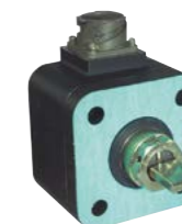
DF17/1 a, ac, ad, b