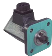
EFI67/1.20.16 a, ac, ad