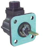
EF67/2.20.16 ad, ae