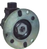
EF67/2.50.16 ad, ae