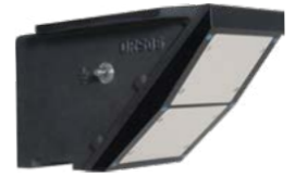
DRS05/1, DRS05/2 & DRS05/3