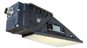
DRS05/1S1 & DRS05/3S1