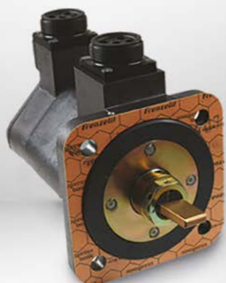
EFI61/2 S1 a, ad AC/pulse generator