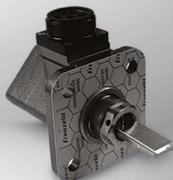
EFI50/1 S1 a, d AC/pulse generator