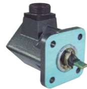
EFI67/1.50.16 a, b, ac, ad, ae