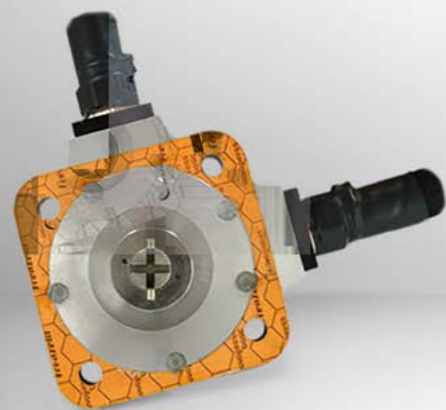
DF16/1 a, ac 1- to 4-channel pulse generator