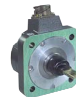
DF16/1 a, ac, ad, af, nf