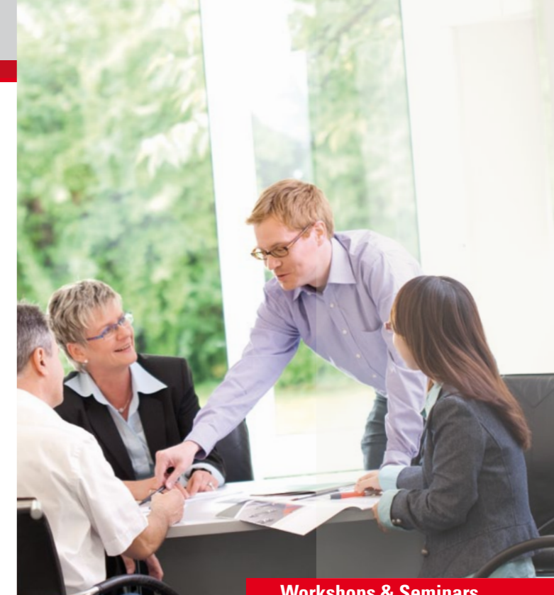
Workshops & Seminars