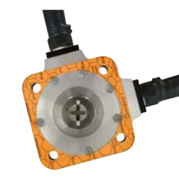
Axle-mounted sensors 1- to 4-channel pulse generator